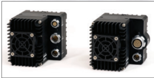
Miro C210J/C210 Backs

1,800 fps at 1280 x 1024 resolution High image quality, with low noise Small and rugged , available in 2 models