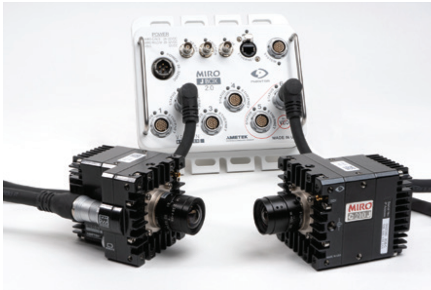
Miro C210/C210J with the Miro Junction Box 2.0